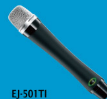
EJ-501T1 Handheld Microphone