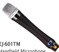
EJ-601TM Handheld Microphone